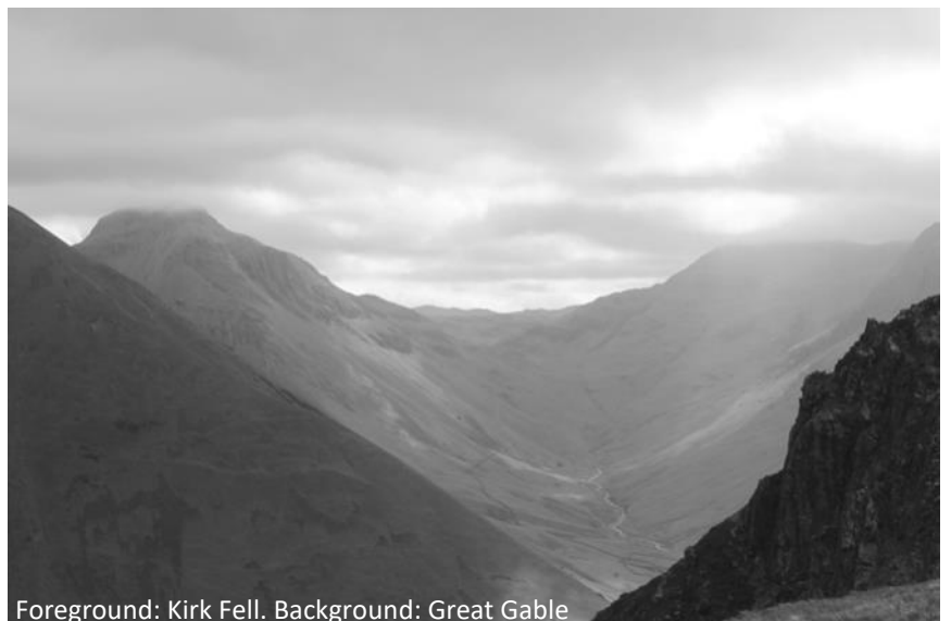
Foreground: Kirk Fell. Background: Great Gable